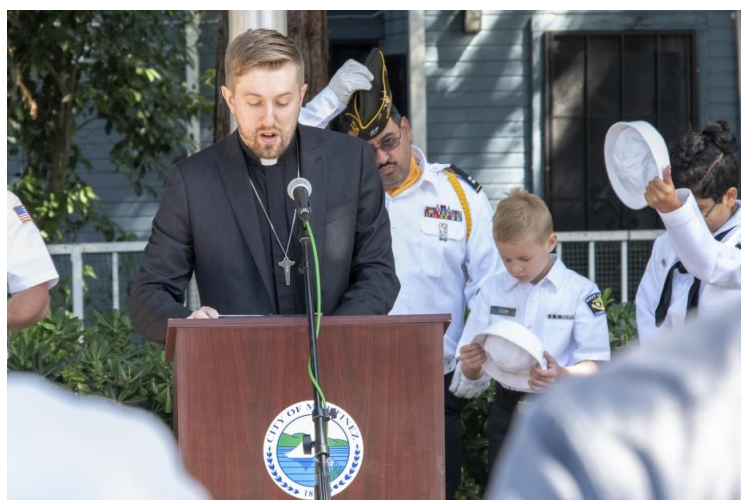
Invocation by Vicar Mundinger