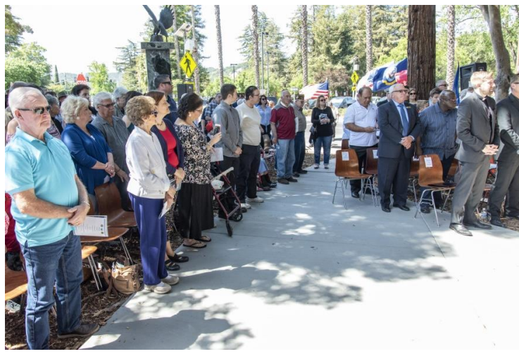
The audience stands for the Vicar's invocation