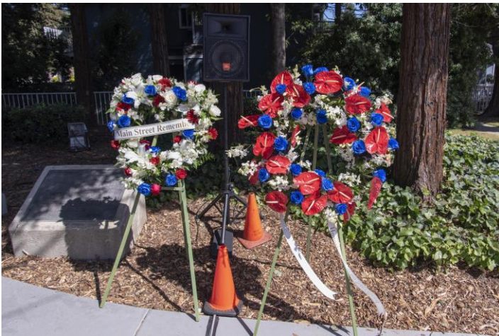
The wreaths to be laid at the monument