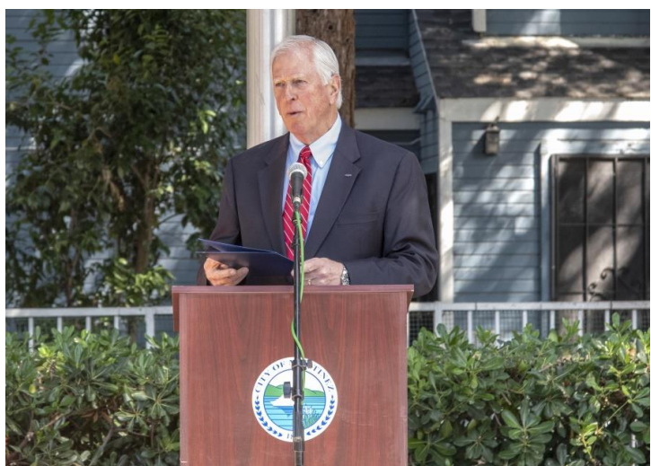
Mike Thompson, US Congress, Fifth District, California