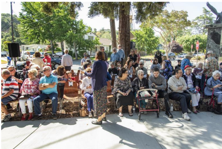
Family members of the Fallen Heroes