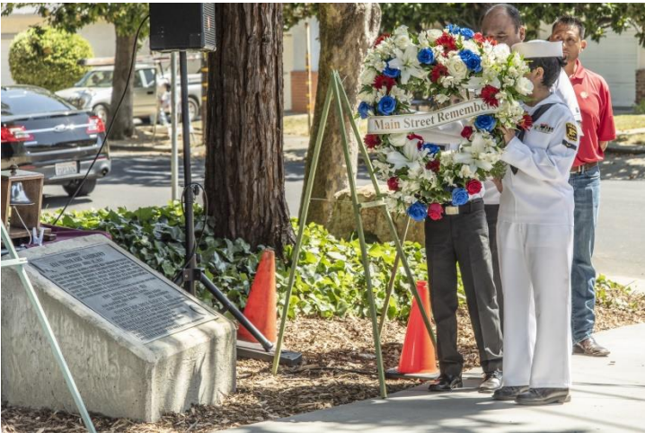
The wreath from Main Street Martinez