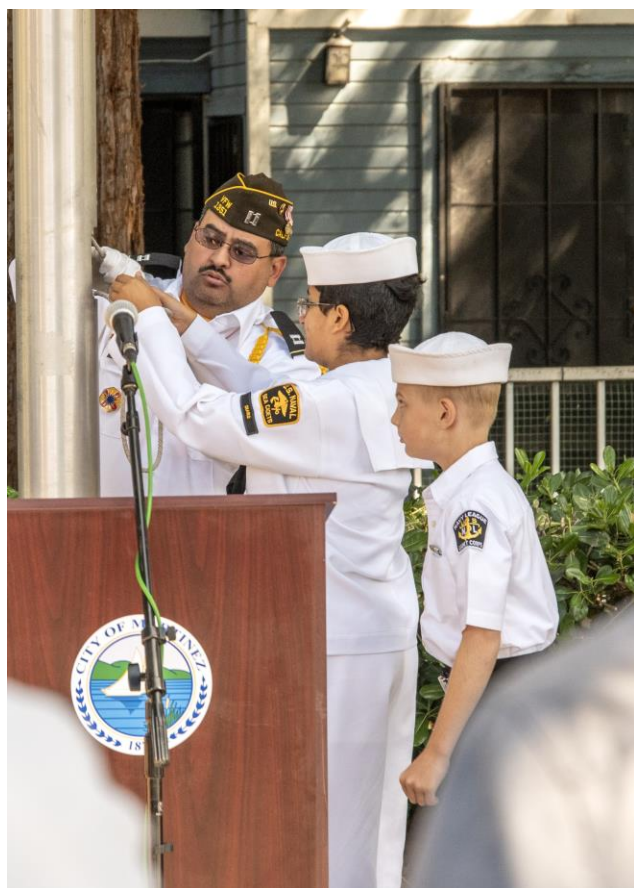
Raising the flag