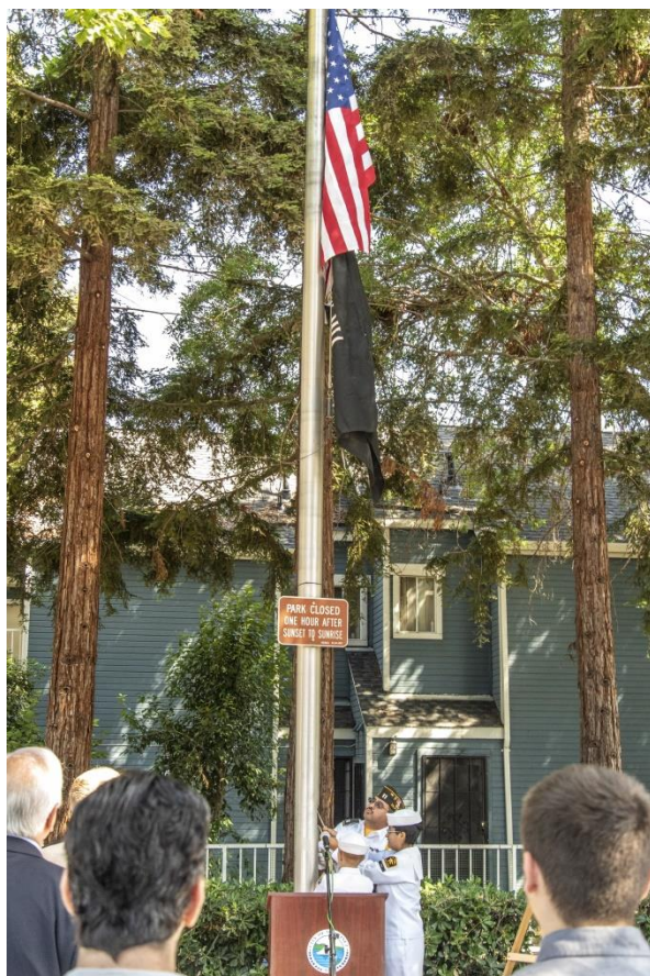
A new flag over a new monument