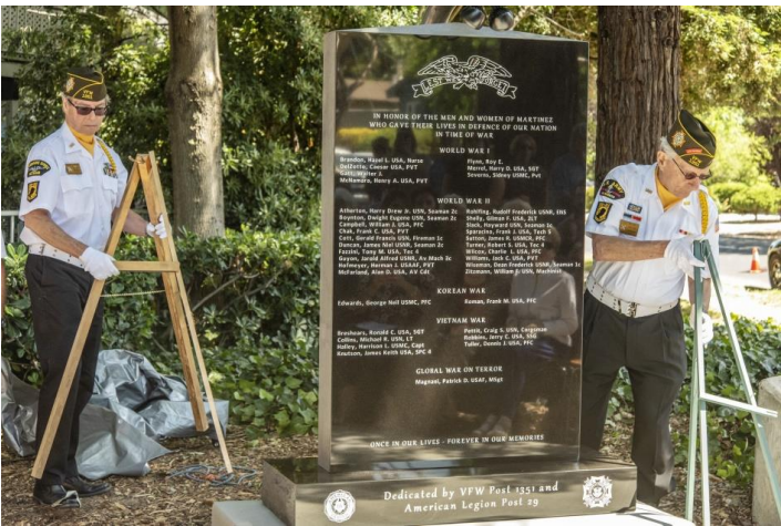
Setting up the wreath stands