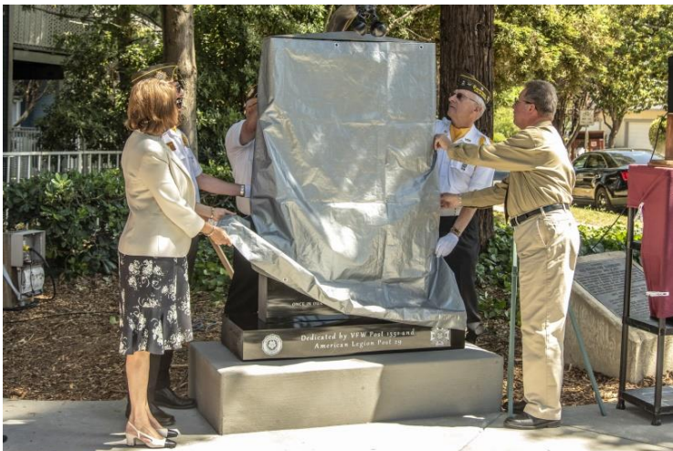
Family members of the Fallen assist in unveiling