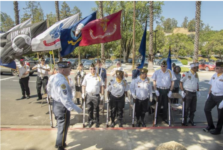
The honor guard