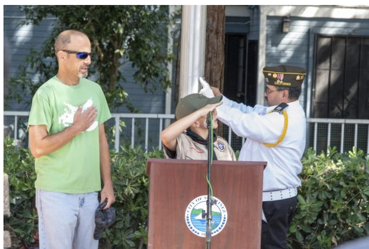
Pledge of allegiance