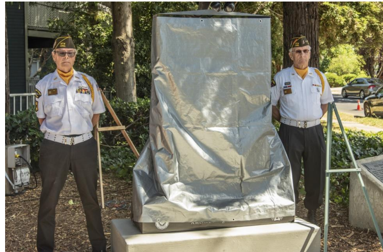
Preparing to Unveil the Monument