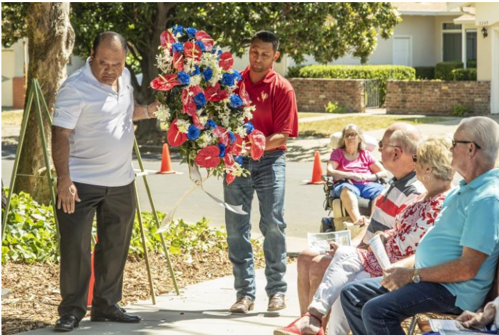
The wreath from Shell Oil Company