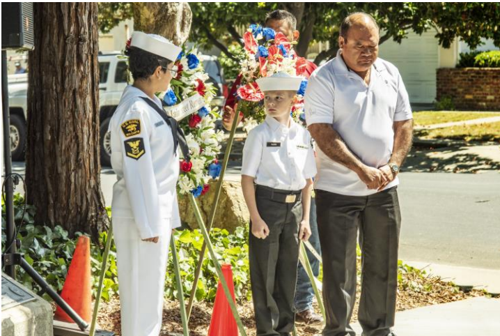
Sea Scouts prepare the first wreath