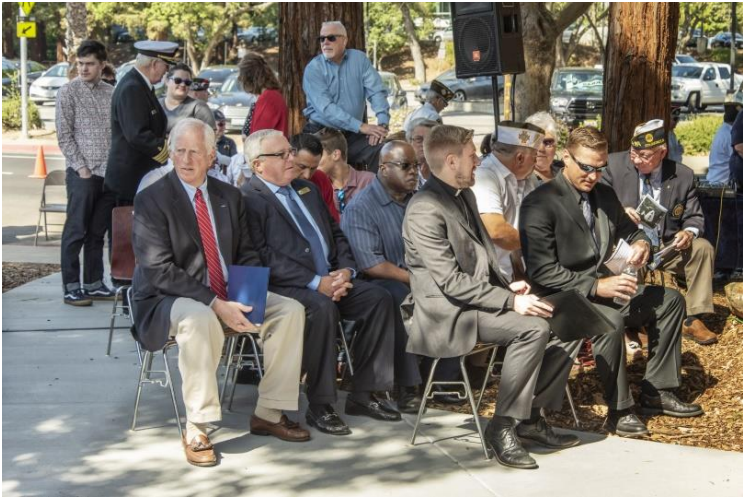
All the Speakers