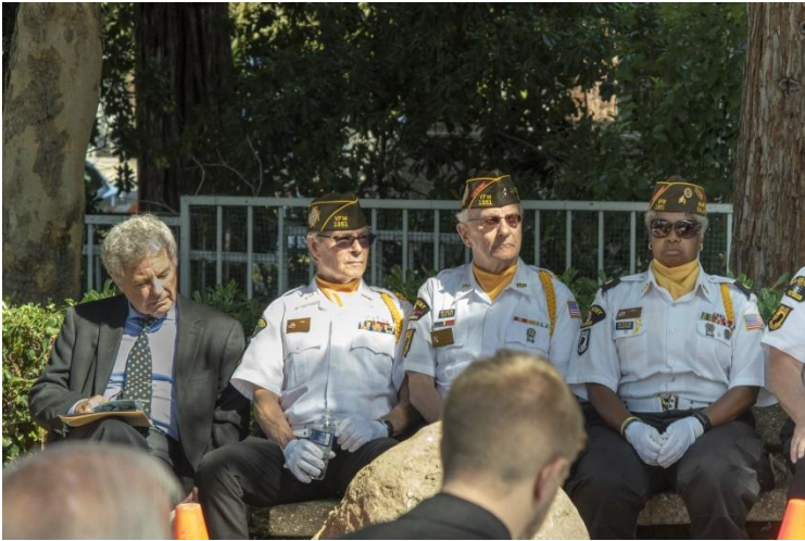
Readers and bell Toller